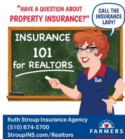
Ruth Stroup Insurance Agency VIEW FLYER | WEBSITE