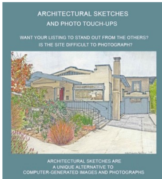
Kathleen Kelley | Architectural Sketches VIEW FLYER | WEBSITE