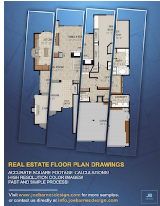
Joe Barnes Design | Floor Plan Drawings VIEW FLYER | WEBSITE